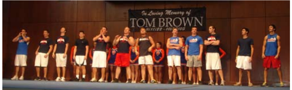
Upper left: Zeta Tau Alpha’s team; Bottom left: There was an overflow crowd on hand to watch the “Bring it On” competition. The philanthropy project raised over $12,000 this year. Right: Beta Brothers get the crowd warmed up prior to the competition.