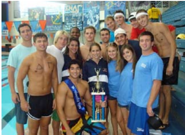
Florida Beta brothers celebrate another successful Delta Gamma Anchor Splash competition!

While devoting a great deal of time to Beta activities, the Gamma Xi chapter had a 3.34 grade point average which was third best of all fraternities. Along with our scholarship, we are excelling even more in campus involvement. Including having brothers that serve as the General Chairman